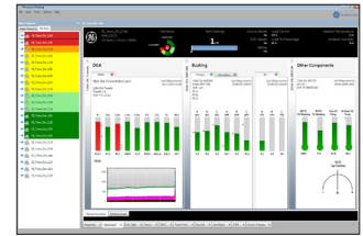
Transformer health/risk overview